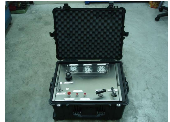
Gas Booster Skid