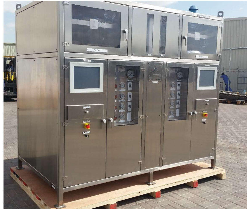
Pressure Test Bay with PLC System