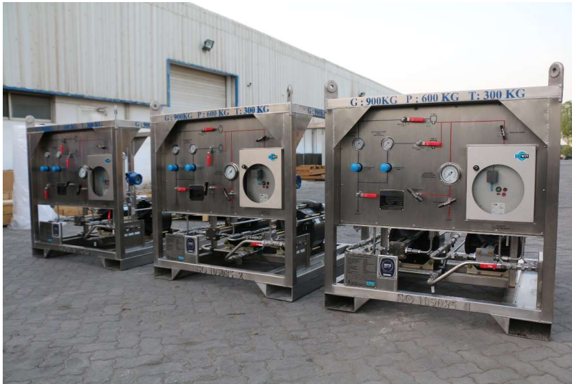
Chemical Injection Skid