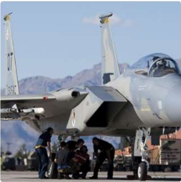
Aerospace and Defense