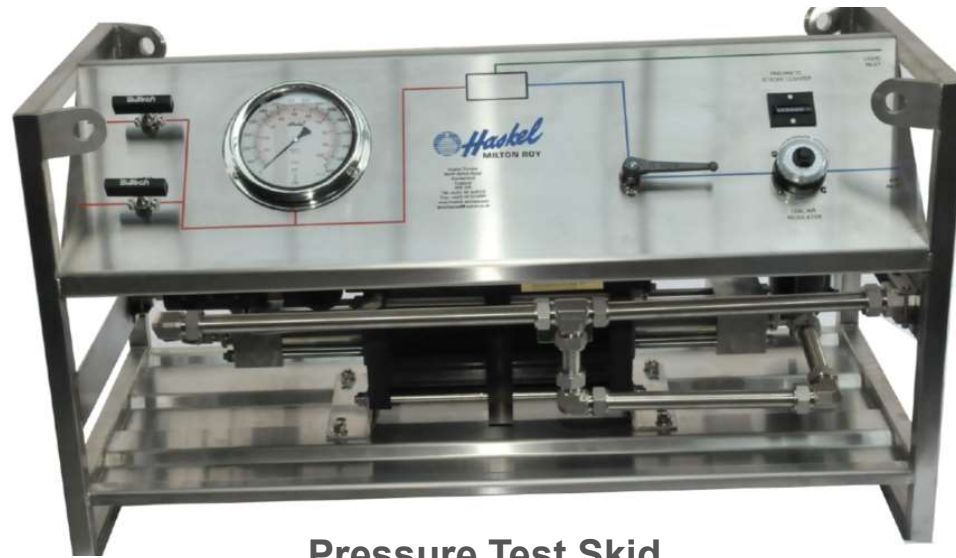
Pressure Test Skid