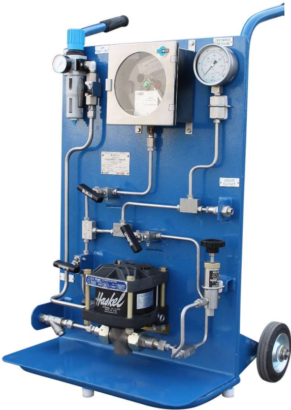
Pressure Test Skid